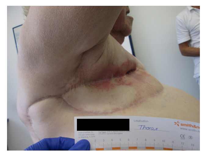
Figure 5. Clinical aspect about 2 years after plastic surgery. The patient had fully recovered. Owing to dermatomycosis, she received a topical antimycotic.